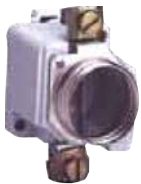
D-Type Fuse Bases, Snap-on, 500VAC/VDC

Mersen D-type fuses are 500 Volts AC/DC rated with 75kA interrupting rating. They have 5 physical sizes (NDZ, DII, DIII, DIV, and DV) and fit into special screw caps. All fuses have blown-fuse indicators which are visible through the screw cap. Screw caps fit onto single pole bases which are screw or DIN rail mounted. All accessories such as covers, adapter rings, and gauge rings are described.