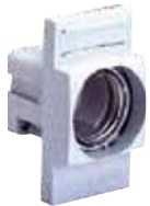
D-Type Fuse Bases, Screw-in